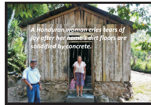
A Honduran woman cries tears of joy after her home's dirt floors are solidified by concrete.